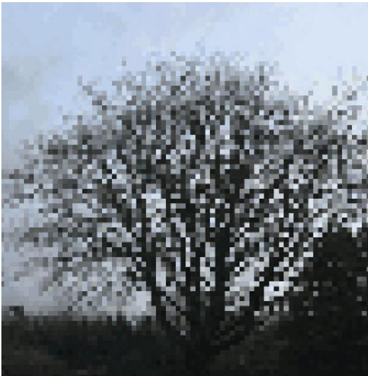
Winter Sky by Isabella R - pixelated a photograph she took. Artwork done on an ipad