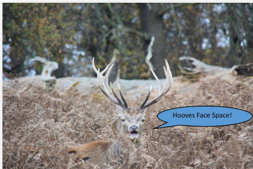
Lower School: Seamus C

Looking at all the entries to the above competition, animals do have a lot to say ! I was very impressed with how funny and creative all the pictures were. Absolutely amazing!