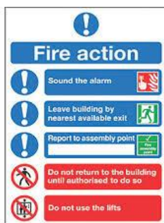
Diagram.1. Fire Instruction Notice

Fire Instruction Notices (see diagram 1 below) are displayed throughout the School buildings at prominent positions, detailing what to do in the event of a fire. All staff are expected to take reasonable care of their own safety and familiarise themselves with these emergency arrangements. If you are unsure you should talk to the Fire Safety Manager.