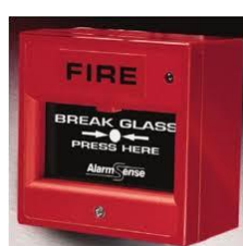
Diagram. 2 Manual Call Point

If you discover a fire, you should immediately raise the alarm at the nearest fire "Manual Call Point" (see diagram 2 below):