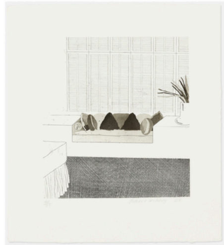
Cushions Signed and Numbered Etching by David Hockney

Whitehead Monckton Limited (no. 08366029), registered in England & Wales. Registered office 5 Eclipse Park, Maidstone, Kent, ME14 3EN. Authorised and regulated by the Solicitors Regulation Authority under no. 608279.